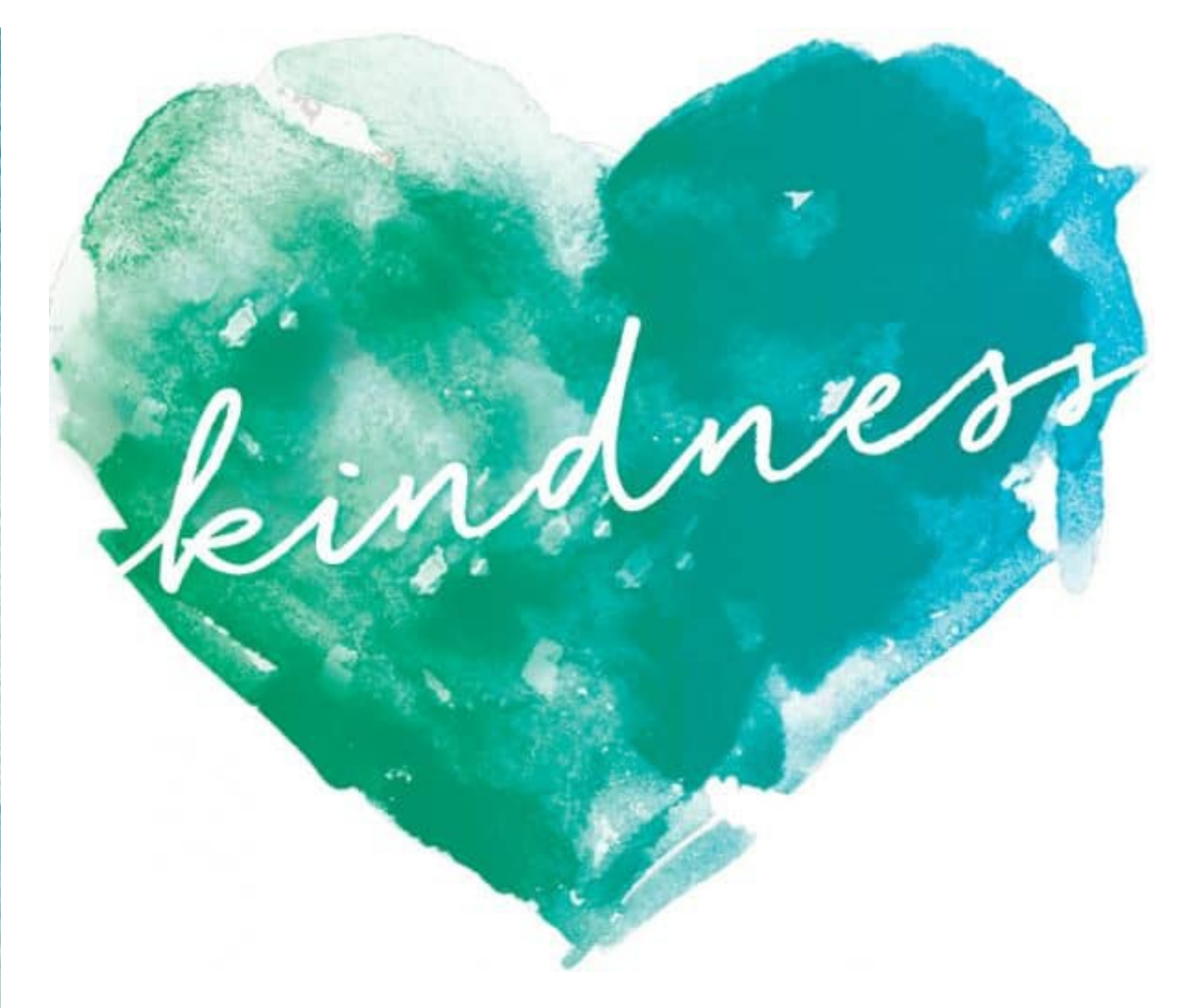
"Unexpected kindness is the most powerful, least costly, and most underrated agent of human change."